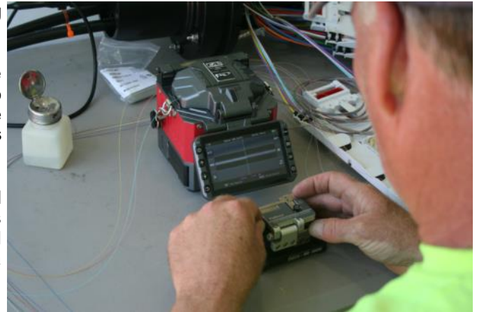
REMC's contractor splices tiny optical fibers to enable the SmartGrid Ring to communicate with all of the cooperative's substations.

Back in March of this year, Jasper County REMC began the first phase of their high-speed internet project implementing the SmartGrid Ring. Currently, the crews are working to enhance existing substation communications infrastructure and install new infrastructure in areas of need. Jasper County REMC is excited to announce they are on track with this part of the project and expect the SmartGrid Ring