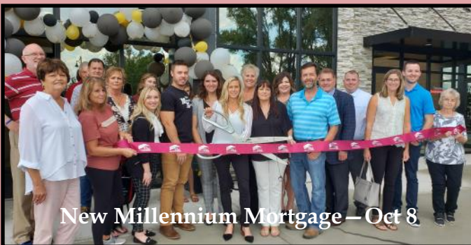
New Millennium Mortgage – Oct 8