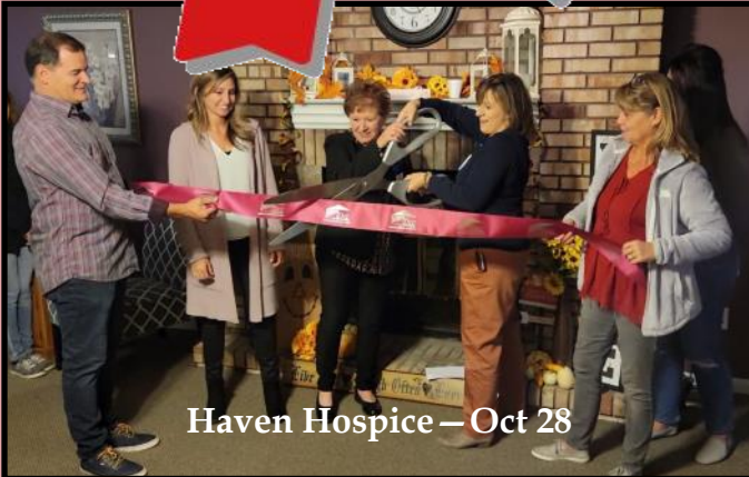
Haven Hospice – Oct 28

E-mail me to schedule your Celebratory Ribbon Cutting