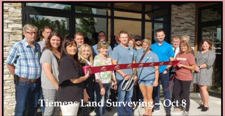
Tiemens Land Surveying – Oct 8