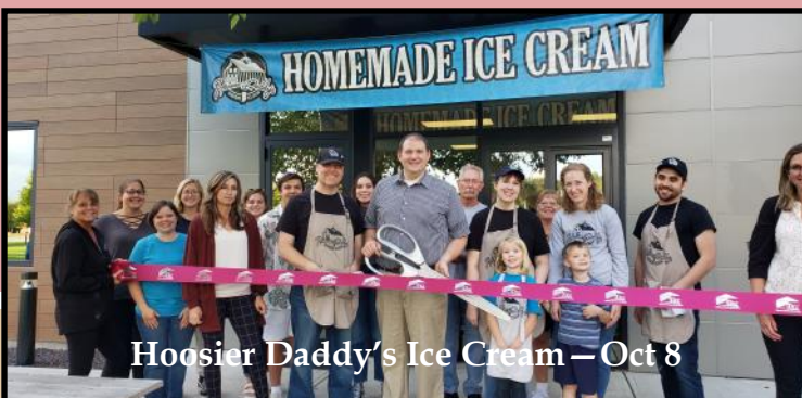
Hoosier Daddy's Ice Cream – Oct 8