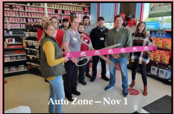
Auto Zone – Nov 1