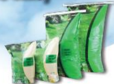
Belstra Tuff Turf Mix Three types of tall fescue *Ideal for our sandy soil

PURCHASE NOW AT BELSTRA FARM STORE 424 15TH ST. SE, DEMOTTE, IN 46310