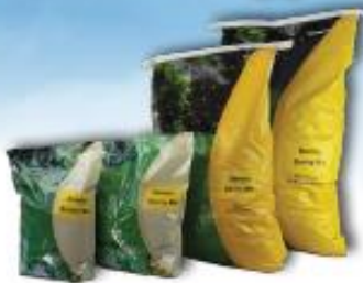
Belstra Sunny Mix Blend of Kentucky Bluegrass, Creeping Red Fescue, & Perennial Rye