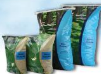
Belstra Shady Mix Two types of Creeping Red Fescue, Chewing Fescue, Perennial Rye, & Kentucky Bluegrass