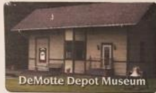
DeMotte Depot Museum