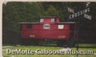
DeMotte Caboose Museum

The DeMotte Historical Society invites you to our